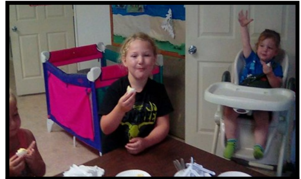
Youth trying new foods as a part of Food Tasting.

Nutrition Program Associates (NPA's) go into schools and other grant eligible locations and interact with community members to help them make healthier choices and build healthy habits. They see the difference the program makes in peoples lives. During 201, University of Missouri Extension's Family Nutrition Program (FNP) reached 1,211 participants directly and 256 indirectly with nutrition education in Clark County during 2016 a significant percentage of which were low income. FNP provides information on nutrition, food, safety, and physical activity for lifelong health and fitness by working with qualifying schools, community groups, and agencies. The Family Nutrition Program provides information on nutrition, food safety, and physical activity for lifelong health and fitness by working with qualifying schools, community groups and agencies. This translates into 605.5 collective workshops hours. Youth from Pre-School to 8th grade learned through kid friendly activities. Activities include opportunities for taste-testing healthy foods and practicing skills that lead to good health. Education for adults also included nutrition, food safety, and physical activity, as well as a resource management .