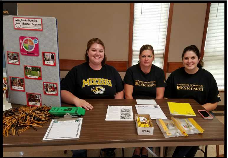
Extension Staff at the Back to School Fair.