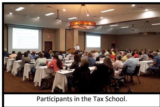
Participants in the Tax School.

Tax preparers gained continuing education credits which are required for their profession. They will put the information learned in the tax school to use with thousands of clients statewide. There were 3 participants from Clark County out of a total of 407 lenders from 91 Missouri counties, plus Iowa, Illinois and Kansas. This translates into 24 hours of workshop hours for Clark County residents, and 3,256 hours total for all tax preparers. Participants were educated in a variety of topics included New Tax Legislation, rulings, and cases, individual taxpayers issues, affordable care act, IRS rules and regulations, business issues, retirement issues, death of a taxpayer and agricultural topics. County residents benefit when local tax preparers have the opportunity to gain knowledge they can use to benefit their clients. Taxpayers benefit by abiding within IRS regulations, having tax preparers that understand agricultural situations, and utilizing the latest tax law changes.