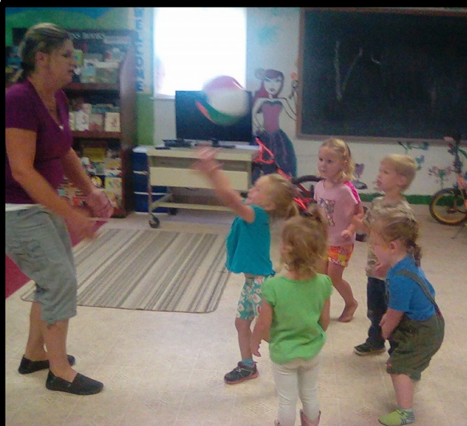
As a part of Food and Nutrition classes, youth learn how active lifestyles keep you healthy.