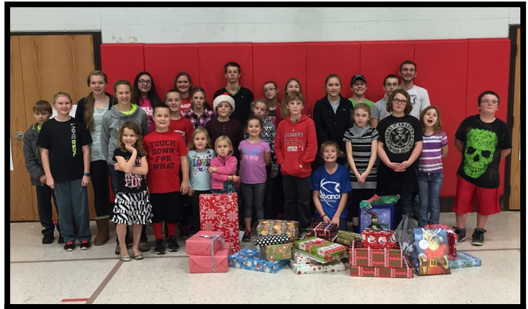
Shamrock 4-H Club members with the gifts they purchased Adopting a Child for Christmas as a community service.

Volunteers gained knowledge in how to offer a valuable learning experience for the youth they are working with while maintaining a safe, supportive environment. Dedicated volunteers help to organize club meetings, fundraisers and events, they also provide learning opportunities for youth in their projects teaching life skills and instilling qualities of character like respect and responsibility in members. Adult volunteers serve as mentors for our youth helping them transition into caring, healthy adults who contribute back to their communities, which is priceless. There were 291 students from 13 classrooms in Clark County that participated in school enrichment programs.