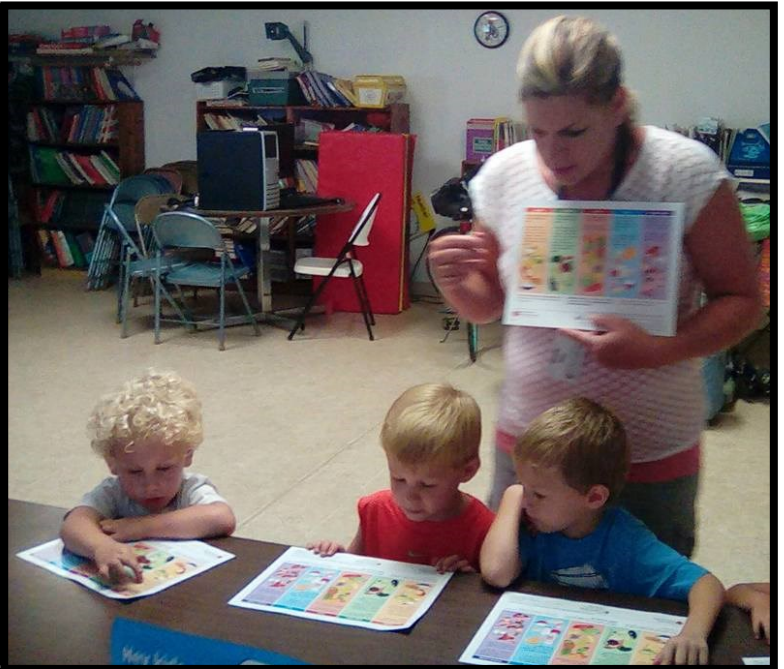
Youth at the Wyaconda Community Center learning about foods from the different food groups on MyPlate.