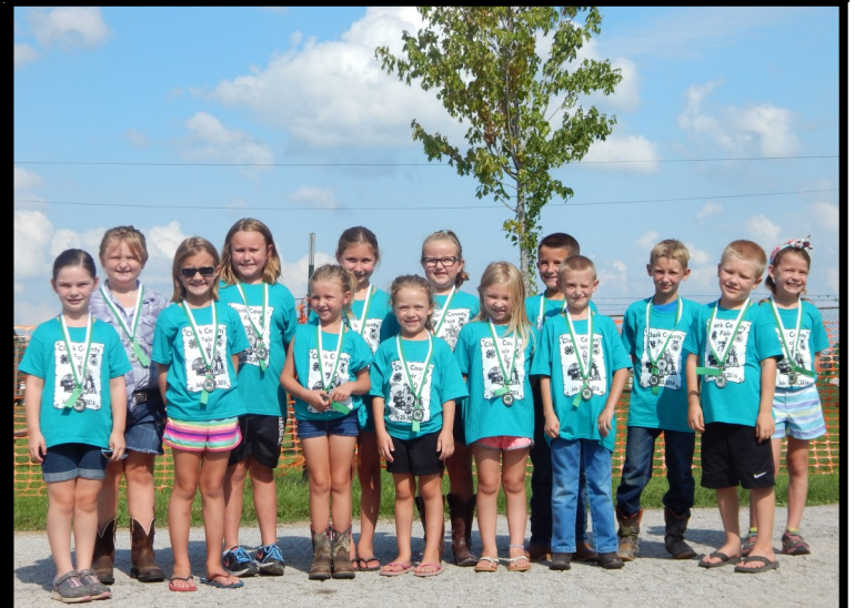
A group of Cloverkids (youth ages 5-7) being recognized for their participation in the 2016 Clark County Fair.