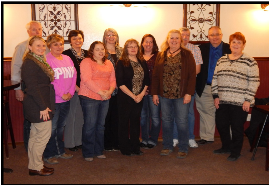
Members of the Clark County Extension Council at the 2016 Annual Meeting.