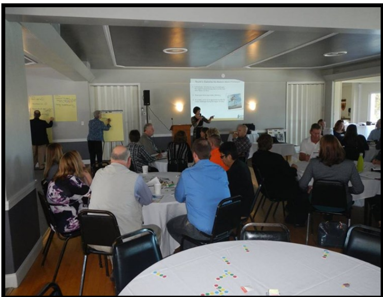
Businesses, community leaders and government offices from Clark County, Missouri; Lee County, Iowa; and Hancock

In 2016 Sessions 2, 3, and 4 were held with community leaders from all three counties, extra input was collected from Clark County residence not actively participating in the project, and the core writing team met on 8 separate occasions to piece together the final plan for submission. From this in depth input process, the core writing team has completed the first draft of the SET Rivers Confluence Plan for submission to USDA. The plan focused on 4 goals: Develop comprehensive outreach program that leverages the strength of community organizations to increase collaboration and