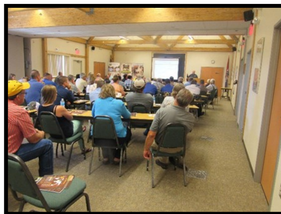
Producers attending the Farm Financial Stress Workshop.

Producers learned current information to help them make better management decisions during tough economic times and influence policy change. There were four participants from Clark County. There were a total of 153 people who attended at the Kirksville and Mexico sites which were two of seven statewide. This translates into 10 hours for participants for Clark County. Topics covered in the program included regional weather impacts, 2015 Prevented planting acres, Lower land values, Dropping farm commodity prices, and Local area broad issue impacts. Producer concerns were heard from around the state, compiled by a team of MU Extension and the Missouri Department of Agriculture. These concerns were then shared further