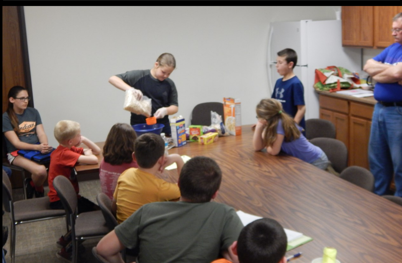
4-H members viewing a demonstration put on by a fellow club member.