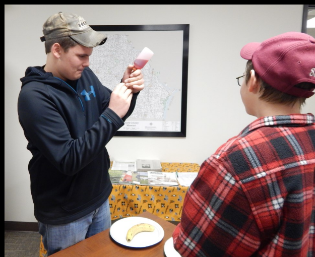
4-H members learn to give injections as a part of the Show-Me Quality Assurance program. Older members then assist younger members in giving both intramuscular and subcutaneous injections to fruit.