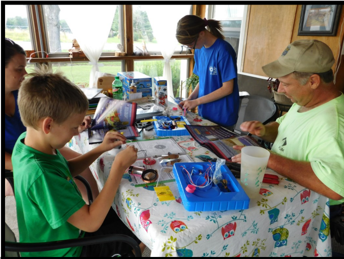
4-H members and Volunteers learn about robotics at a project meeting.

partnerships by 2018, Increase the number of Stage 2 Businesses in the Region by 5% to 495 by 2021, Increase the number of Confluence Regional full-time positions filled with regional workforce by 10% by 2021. Provide infrastructure that increases connectivity and facilitates the expansion of existing businesses. This relationship building increases the region's ability to approach problems holistically. The plan will be implemented after it is passed by USDA. Currently, the project participants are looking at opportunities to leverage USDA project funds for the project to employ and Americorps VISTA volunteer to work to execute part of the project's goals. At least seven community leaders from Clark County participated in the Tri-State process totaling roughly 44 hours.