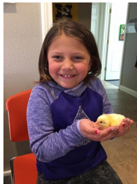
Local youth come to the Extension Office to learn about Embryology