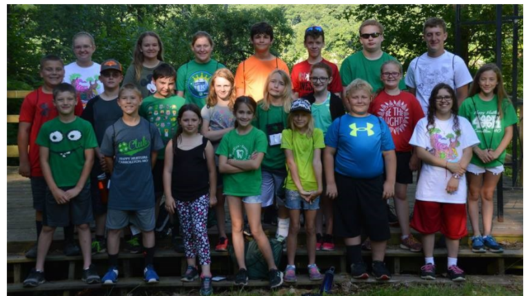
Carroll County 4-H members attend Heit's Point 4-H Camp